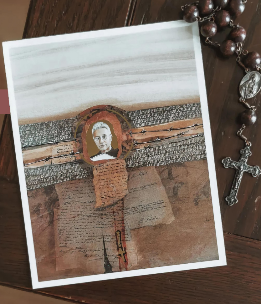
▲ Image from Titus Brandsma's Beatification in 1985

In December 1935, following the harsh anti-Jewish Nuremberg Laws, Titus contributed an essay to a collective work by Dutch intellectuals. His contribution, The Delusion of Weakness , suggested that the root of discrimination was envy. The Nazi myth of the Superman grew out of an imagined feeling of inferiority because of success and accomplishments within the Jewish community in Germany. He proposed instead that anyone who was uncomfortable with Jewish contributions should see them as a motivation to create his own success without rancor. In a quick response, Nazi writers in Germany called him a crafty professor, a Jew lover, and even a Communist.