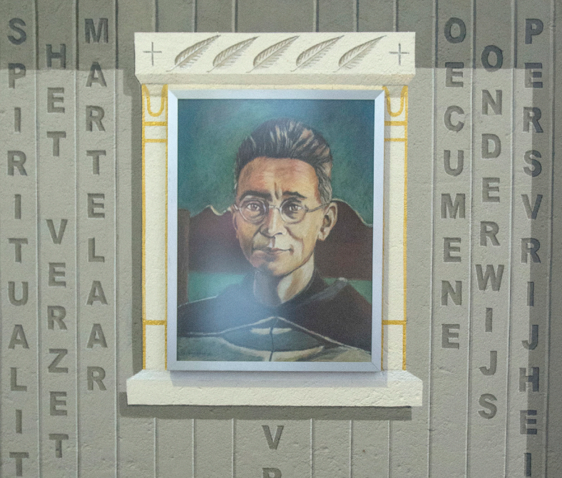
▲ Titus Brandsma Chapel, Our Lady of the Immaculate Conception, Zenderen, Netherlands

tradition and spirituality. The value of the human person was paramount in the eyes of God. "See how these Christians love one another."