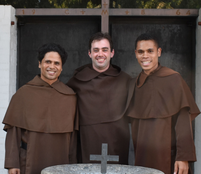
▲ Carmelite students visit Dachau Concentration Camp in 2018