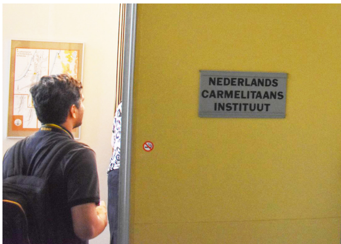
Dutch Carmelite Institute at Boxmeer