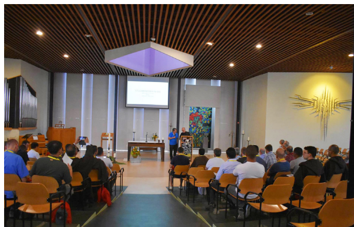
Titus Brandsma Parish, Oss