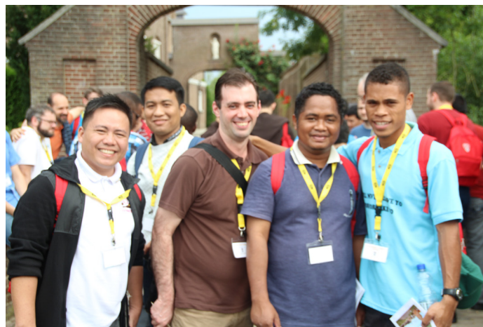
Student friars from the Asian Region

Our midday prayer in the Titus Brandsma Parish Church reflected the simple style of prayer used in