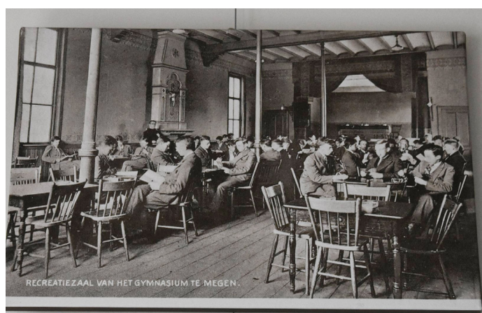
Recreation in the Minor Seminary