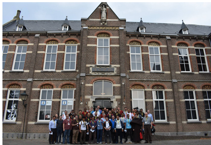
The Acropolis boarding house & Minor Seminary

Titus lived as a student friar studying theology and was ordained in 1905 (Oss 1903-1906). He returned to Oss following his doctorate studies in Rome in