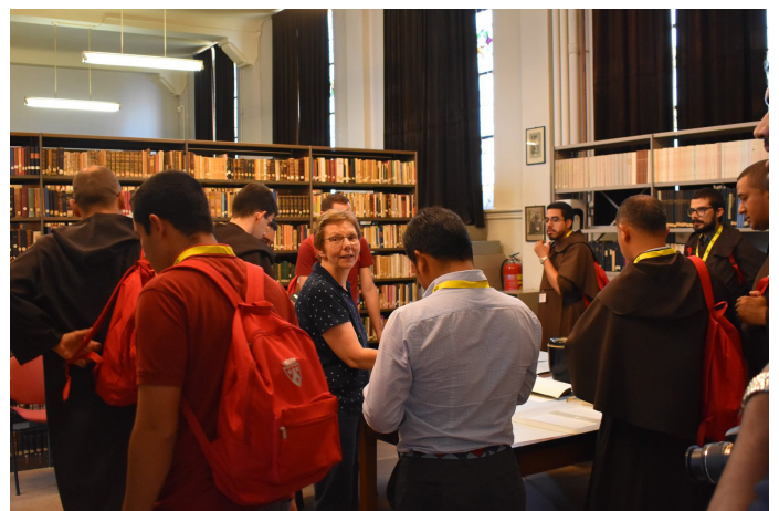
Student friars with the Archivist